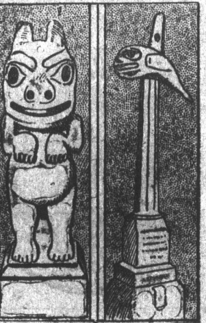
MARBLE TOTEM POLES.

The totem poles of Alaska Indians have always been a subject of interest among ethnologists, and their strange appearance has excited the curiosity of the general public. Formerly these symbols of clanship were of wood, but recently some of the