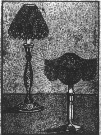
BEAD CANDLE SHADES.

Two pretty candlesticks and shades are here shown. These beautiful shades are made at home out of beads strung and hung over a wire frame. They may be strung in a pattern, a design, or they may be strung from one color. The effect is candy-like. The