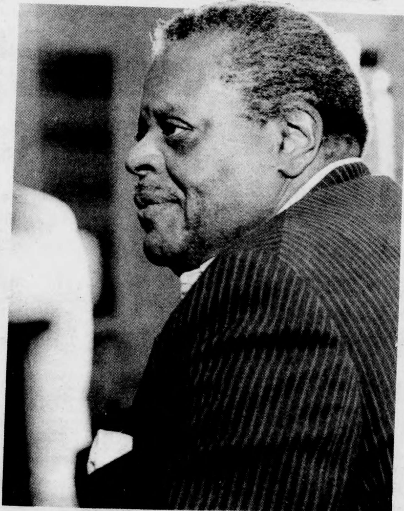
Jazz pianist Oscar Peterson, who will be installed as Chancellor of York University at Burton Auditorium on September 13.

From November 5 to 9, fourth-year acting students will be presenting Bertold Brecht's thought-provoking masterpiece The Good Person of Szechuan at the Studio Theatre in Fine Arts Phase III.