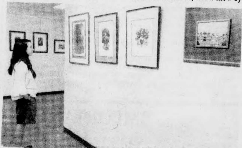
A student gets the "art experience" at an exhibition of Ecuadorian art at Bethune's Art Gallery. Don't take our word for it! Check out any of York's many art galleries yourself!

There are many other galleries and opportunities to have the "art experience" on campus. Grab a copy of the Up York for more information about galleries on both campuses.