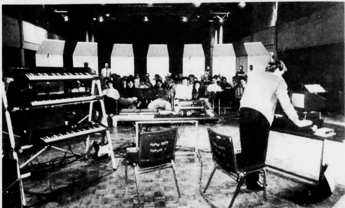
LET'S MAKE MUSIC: An attentive crowd at McLaughlin Hall savours the swingin' sounds of computer music at last week's "Soft Music" presentation. Barry Manilow, eat your heart out!