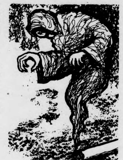
'Sure are a lot of dope friends in this part of the world'

Several nights ago we were among those who climbed 5,000 steps to reach the top, arriving, after four and a half hours of walking, at 3:00 a.m., in time to freeze for two and a half hours before witnessing a sunrise unlike any I had ever seen before. A collective gasp went up from the onlookers as the first streaks of red illuminated faint wisps of cloud stretched out across the horizon, and the mist slowly melted to reveal a carpet of tea in the valleys below. I can imagine that the coming of morning atop Adams Peak must be inspirational for the Buddhist pilgrims fortunate enough to make the visit: for us it was merely incredible. Interrupting my reverie, the stewardess arrives with lunch. An hour later, and we are beginning our descent into Bangkok, while I contemplate random impressions of this city of four million people: gateway to the Orient, ultramodern; efficient; congested axis of the golden triangle which supplies most of the world with heroin; home for thousands of expatriate Burmese, Laotians, Cambodians and Malays. For us Bangkok is a waystation — a rest stop on the way to Australia.