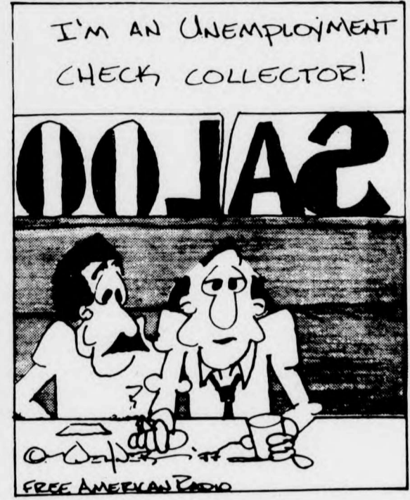
Unemployment — Chômage, Canada