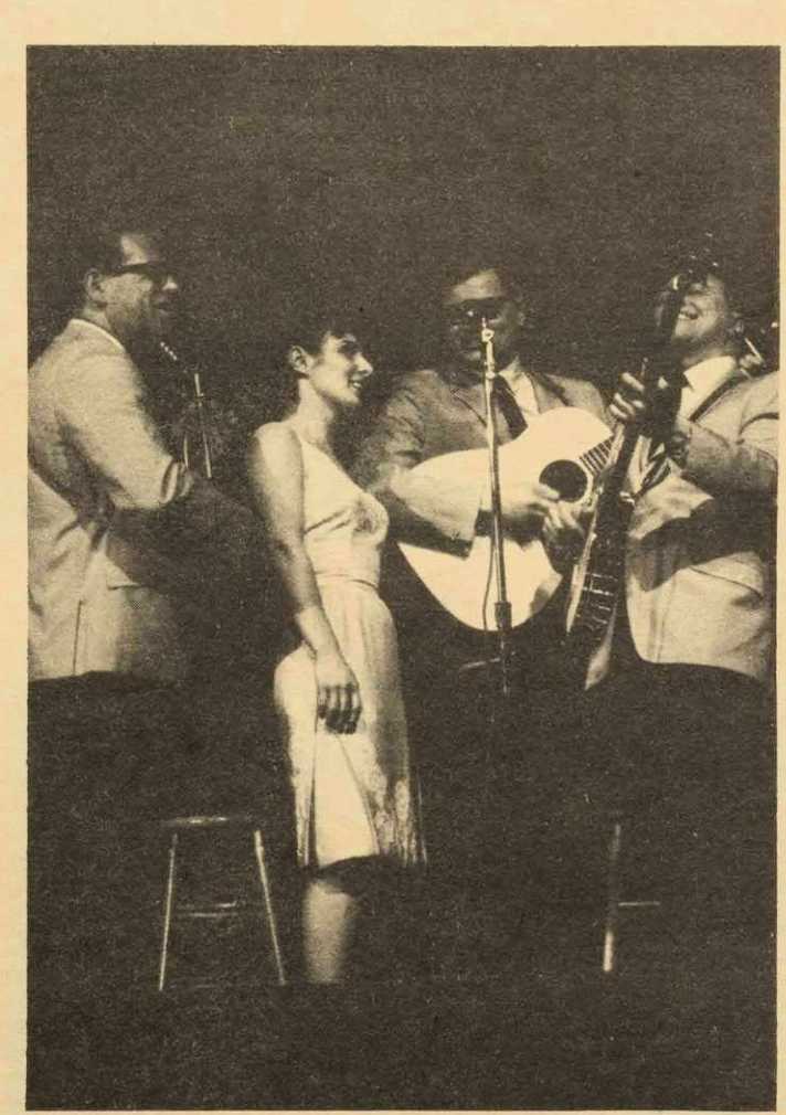
Travellers held forth at Commerce Society concert several Fridays ago. Described as better entertainers then musicians, they sent most of the rabble home laughing.