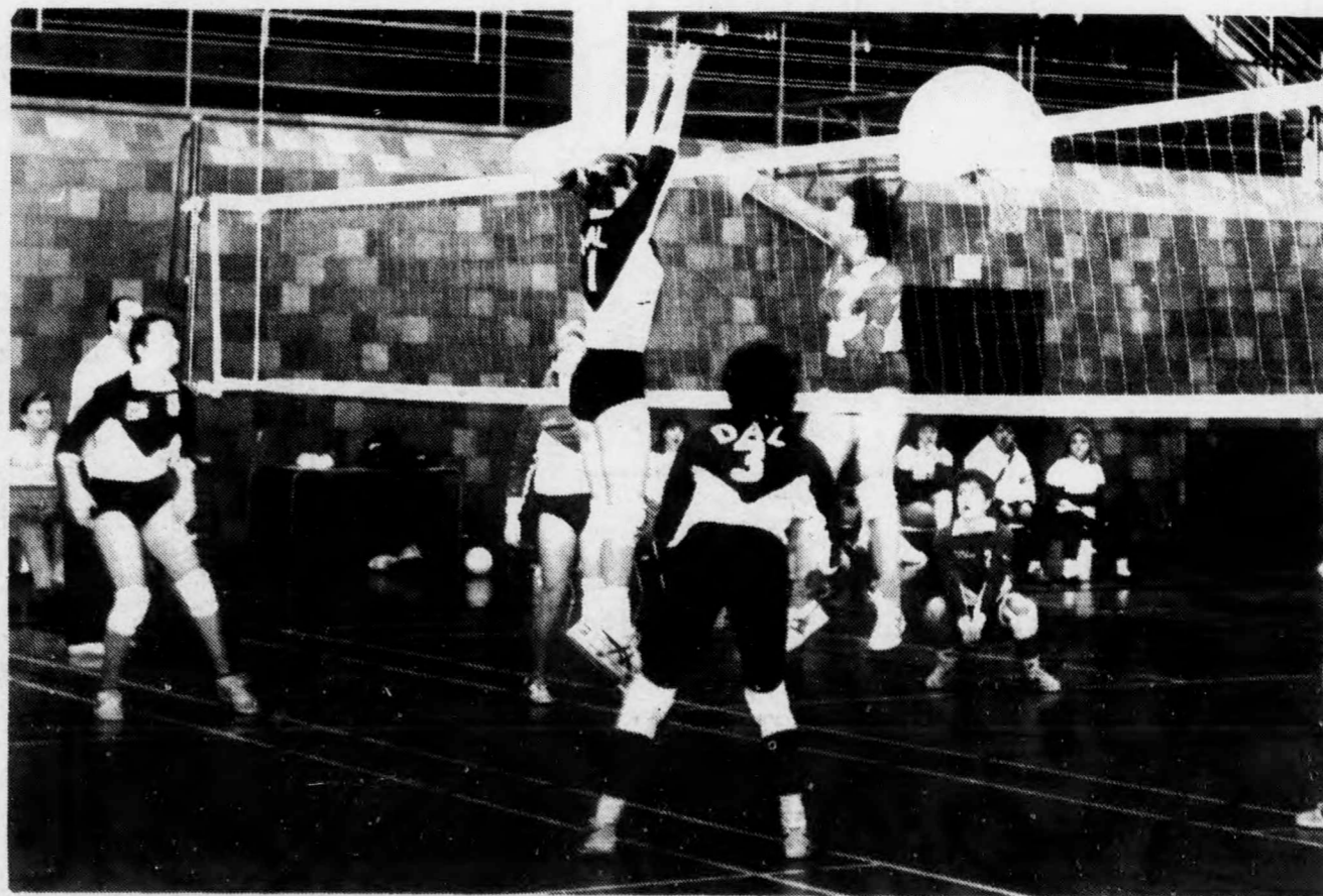
A successful spike! A UNB Red jumps high to score a kill against Dal.