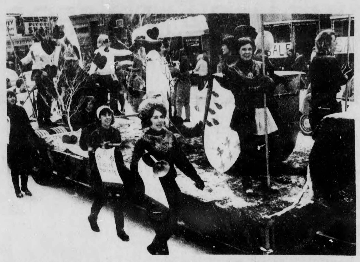
One of the major social events of the college year is the annual Winter Carnival. The UNB—STU Winter Carnival features major entertainers, and other exciting activity. This year's head-liners will be The Lovin' Spoonful . It takes place in February and is open to the public.

Another of the more active organizations on campus, its job is to present the university with radio programming every day of the week. For those interested in radio programming this organization offers first hand experience in operating the controls and announcing. The equipment,