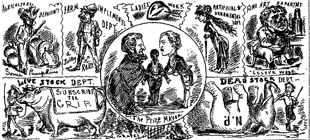
THE OPENING OF THE GREAT EXHIBITION.