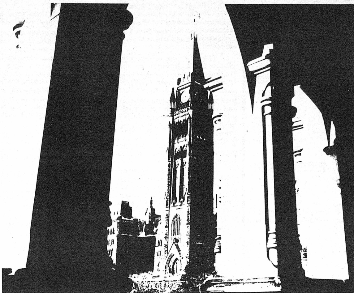
The Peace Tower might be misnamed... The House of Commons Peace Tower might shadow the grey depression of disgruntled and dismayed civil servants.

And it appears the federal government has become so plagued by patronage that it can only respond to major problems in a patronizing manner. The unemployed are being patronized by being slotted into mindless, low-level, dead-end civil service