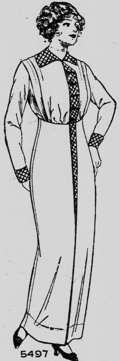
5497 Practical design for a lady's costume, for the construction of which any inexpensive material may be used.

Plaid linen forms the decoration for the front, the collar and cuffs and of this, 1 yard of 36-inch material will be required.