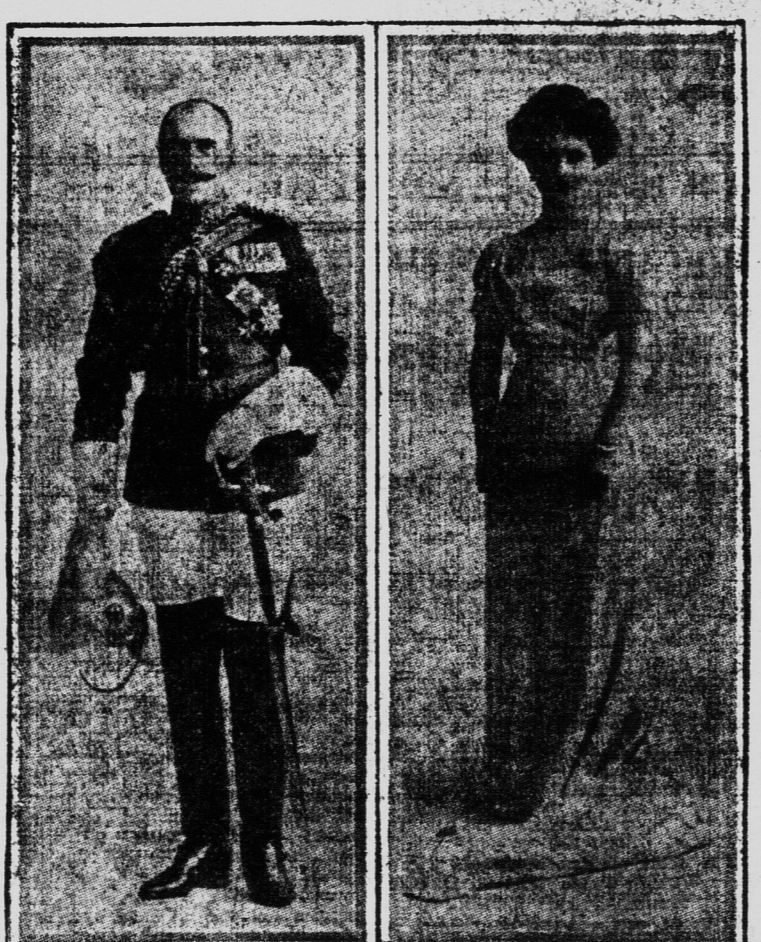
PRINCE AND PRINCESS ALEXANDER, OF TECK.

Official word comes from London that Prince Alexander of Teck, third son of the late Duke of Teck and brother of Queen Mary, is to succeed the Duke of Connaught as Governor-General of Canada.