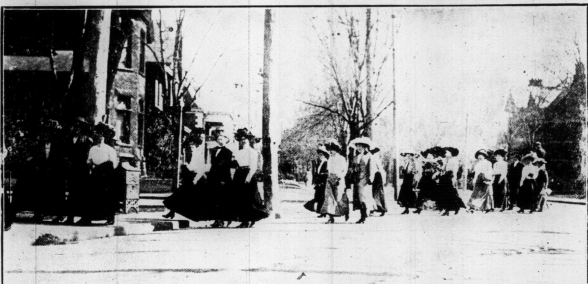
LADIES' PAPER CHASE OF EATON ATHLETIC ASSOCIATION ON SATURDAY, MAY 6.

The score of "The Red Mill" is by Victor Herbert, who has long been accepted as the foremost American composer. He has written nineteen light operas, among them "The Prima Donna," "Mlle. Modiste," "Babes in Toyland," "It Happened in Nordland," "The Tattooed Man," "The Serenade," "The Fortune Teller," "Babette," "The Wizard of the Nile," "The Idol's Eye," "Wonderland," "Dream City," "The Magic Knight," "The Singing Girl," "Dolly Dollars," etc., all of which have been big successes and many of which are still being played both in America and Europe. He is equally well known as a writer of serious music and is himself a virtuoso of the highest type. His symphonic poems are included in the programs of symphony orchestras all over the world. His concertos for the cello are the accepted standard of musicianship. When Oscar Hammerstein decided to have grand opera written upon an American subject for production at his Manhattan Opera House, Mr. Herbert was the one musician in the States worthy of this commission, and he was unhesitatingly chosen. The score of "The Red Mill" is in Mr. Herbert's happiest vein and is replete with brilliant ensembles, tuneful numbers, every one of which has a different and distinct charm and appeal to the ear. Of the twenty