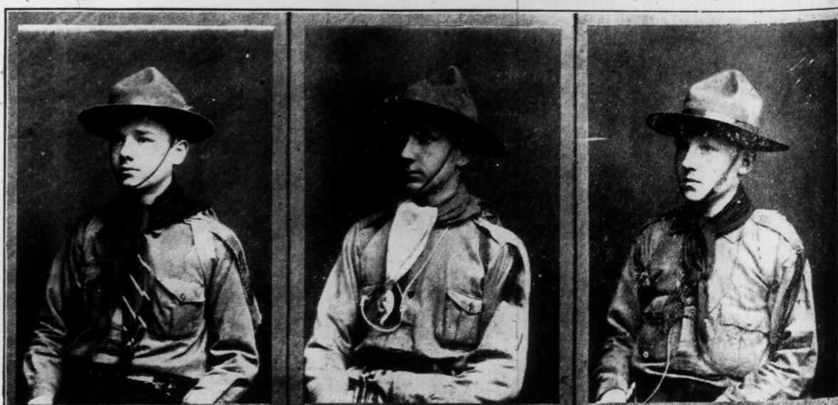
HAMILTON SCOUTS, WHO WILL TAKE PART IN CORONATION CEREMONIES AT LONDON.