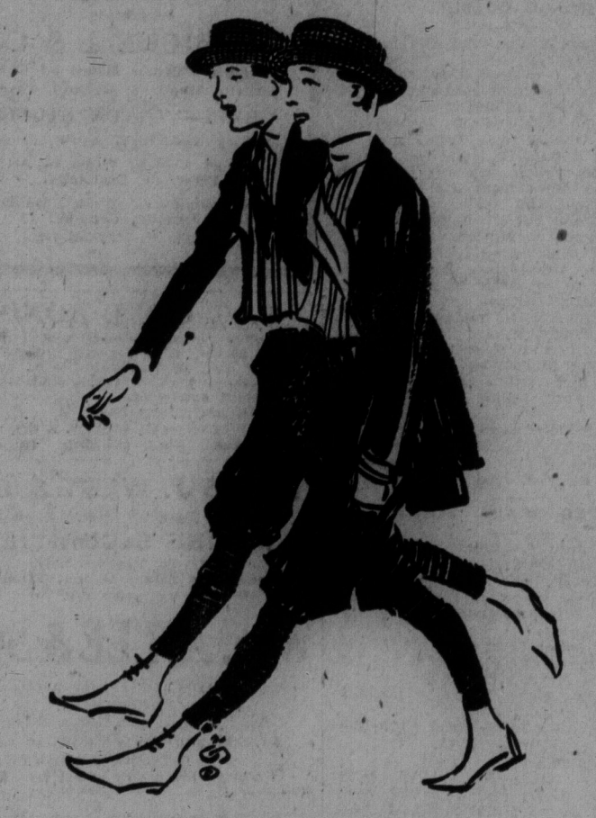
Regularly $20.00 to $25.00.