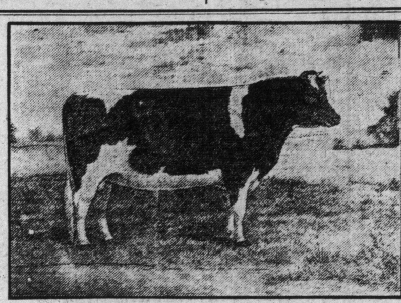
A BEEF AND MILK HOLSTEIN BULL.

scale towards profit in any other farm With sheep husbandry as with other lines of farming it should be the aim to so conduct the business as to be able to put the products on the market when they are in greatest demand and bring the best prices.