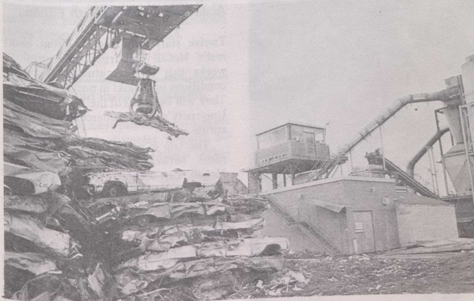
Powerful claws pick up a junked car and lift it to the mouth of a car shredder. On the right is the pneumatic sorter, which removes light debris from shredded car material.

(The preceding excerpts are from an article by Michel Brochu for Science Dimension, 1978/4.)