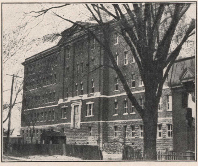
Christian Bros.' School, Longueuil, P.Q., recently completed. 18,000 square yards of SACKETT PLASTER BOARD were used in this building.

Architects in Canada are rapidly realizing the unequalled advantages of SACKETT PLASTER BOARD over both wood and metal lath, for various reasons:—