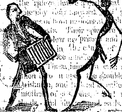
Members of Parliament dancing at his excellency's ball.