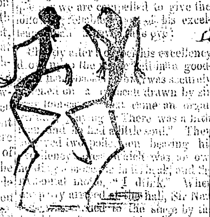
Members of Parliament dancing at his excellency's ball.