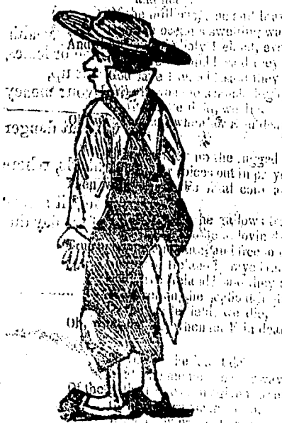
Hon. Member for Restigouche.