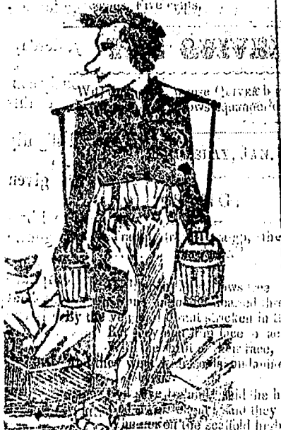
Pea-Soup Carrier, attached to the Legislature.