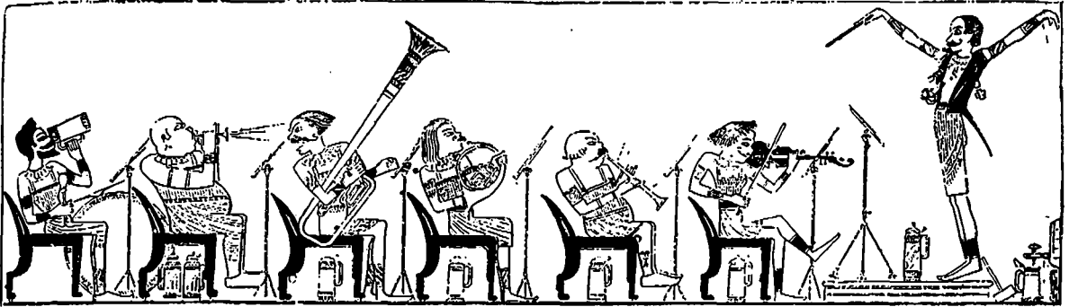
BAS-RELIEF IN HONOR OF THE VISIT OF THE STRAUSS ORCHESTRA.