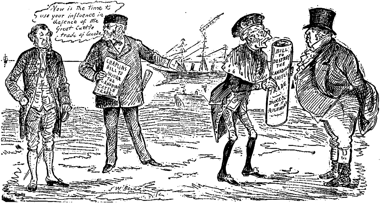
A FINE OPPORTUNITY FOR OUR GOVERNMENT TO HEAD OFF THE CONSPIRACY AGAINST THE CANADIAN CATTLE TRADE.