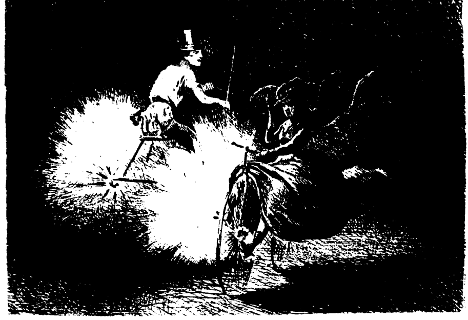
THE TRANSIT OF VENUS

P. O. Box 1022, Toronto. No. 34 Union Block, Toronto Street, Toronto. 10-14-33-7.