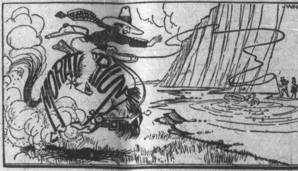
From the Bulletin (Glasgow, Scotland).