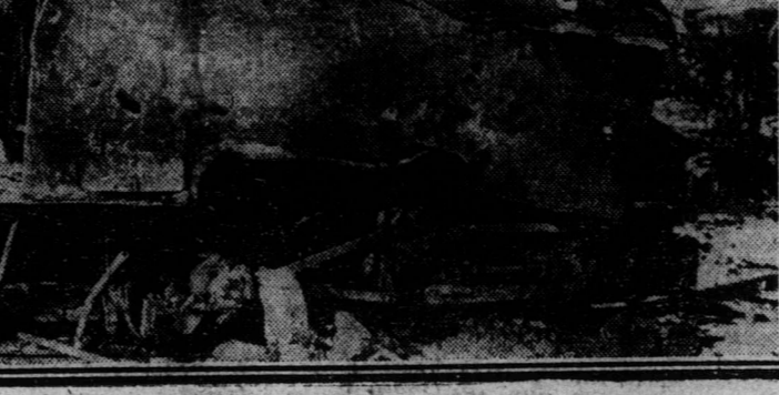
This picture shows what the British artillery did to a German light engine actively employed in bringing up supplies to the enemy's trenches.