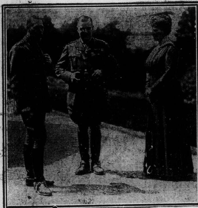
KING AND QUEEN AND THE CHIEF OF STAFF. An unusual photo of the King and Queen of Great Britain in the Royal Pavilion at Aldershot. They are seen in conversation with Gen. Sir Wm. Robertson, Chief of Staff of the British army.