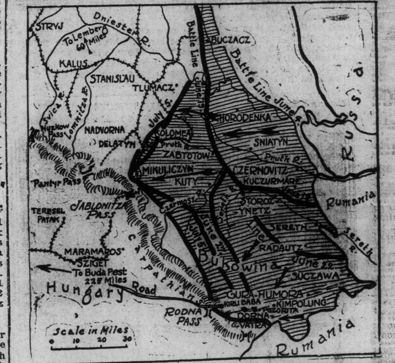
RUSSIAN CAVALRY HAS CROSSED CARPATHIANS. (Map) Arrows indicate Russian advance made in recent drive toward the Carpathians, which have been passed by cavalry and now operating in Hungary.