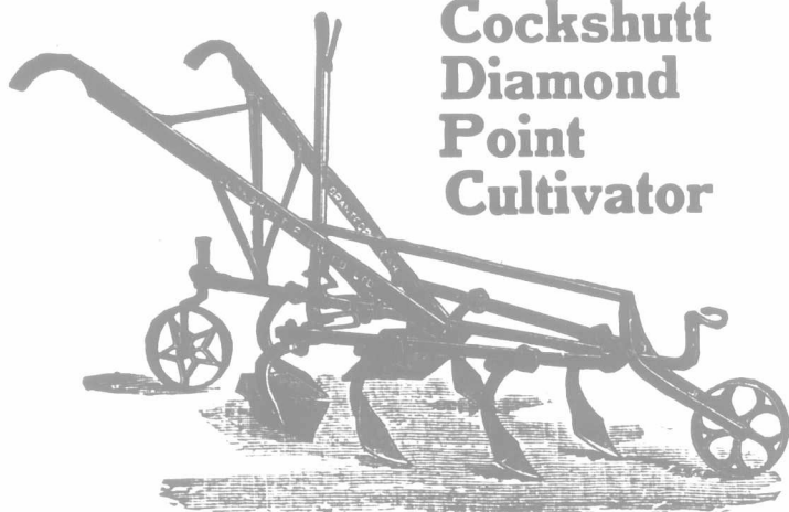
Cockshutt Diamond Point Cultivator

The Cockshutt Diamond Point Cultivator is built with the same care and of the same reliable materials as the Ruby, but is of somewhat heavier construction.