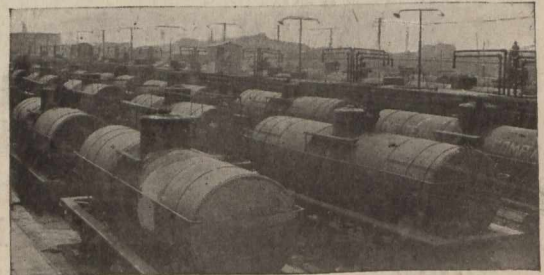
"Imperial Asphalts can be quickly delivered to any part of the Dominion. They come in tank cars or packages, whichever is best suited to your requirements."

"There are three Imperial Asphalts for road purposes, Imperial Paving Asphalt for preparing Hot-Mix Asphalt (Sheet Asphalt, Bitulithic, Warrenite, or Asphaltic Concrete), Imperial Asphalt Binders for Penetration Asphalt Macadam and Imperial Liquid Asphalts for dust prevention and for increasing the traffic-carrying capacity of earth, gravel and macadam roads."