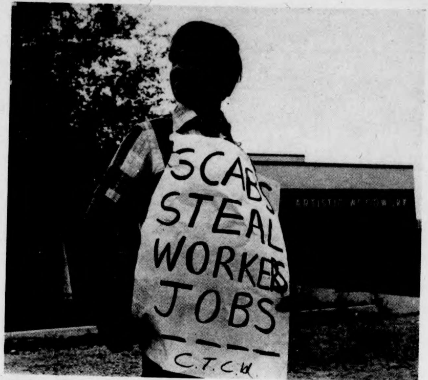
Artistic Woodwork worker on strike for better wages, two years ago.