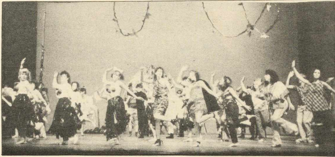
students who played a role in defending last year's title

In fact, this year's show will be the biggest (and hopefully the best) ever as three more schools join the "traditional five." The schools of Health Services Administration, Human Communication Disorders, and Social Work will be performing five-minute filler spots between the five main 15-minute acts.