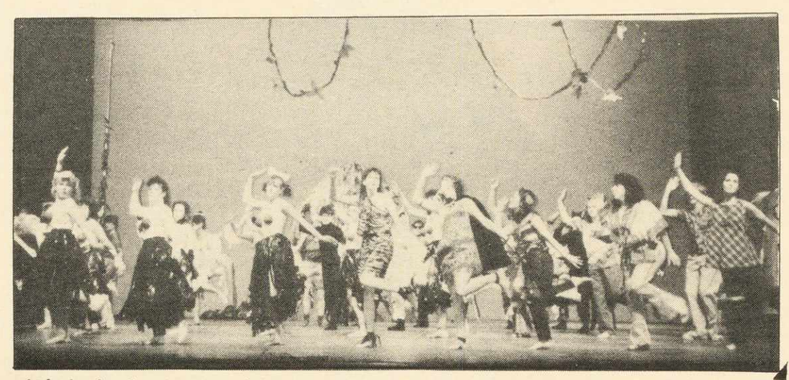
students who played a role in defending last year's title

In fact, this year's show will be the biggest (and hopefully the best) ever as three more schools join the "traditional five." The schools of Health Services Administration, Human Communication Disorders, and Social Work will be performing fiveminute filler spots between the five main 15-minute acts.