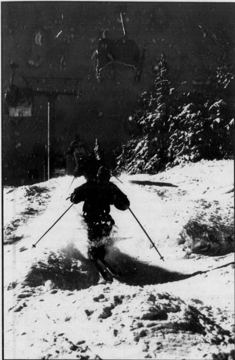
The heated cabins of Killington's Skyeship lift carry skiers two and a half miles to the top in just over 12 minutes, offering breathtaking views of the Green Mountains along the way. Each 8-man cabin is uniquely hand-painted with bright colors and designs.