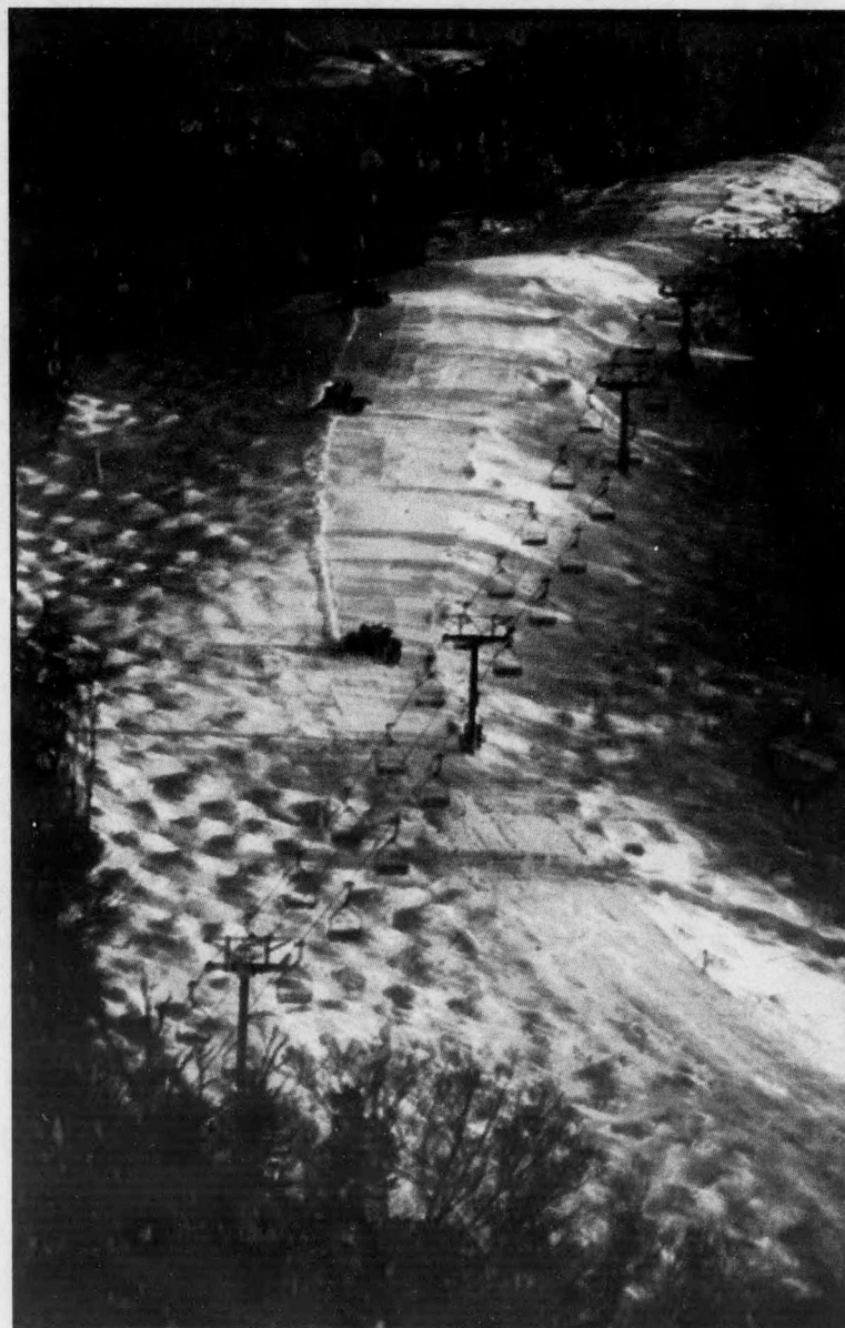
Killington's fleet of 21 "stealth" grooming machines, along with the world's most extensive snowmaking system, insure a variety of flats, bumps, and steeps. Special thinning in wooded areas provides backcountry "Fusion Zones"

4 guys, a small car, no roof rack, skis, snowboards, cheap beer, and Taco Bell. The nice people at Killington Vermont were daring enough to have us on the mountain for four days and three nights.