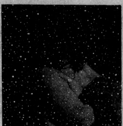
Jane Kelly Arts 2 "It's up in the air"