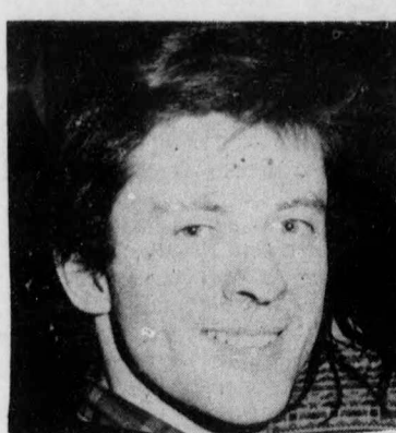
STU Arts 4 Of course. Why anyone in their right mind would fully agree that greatness even for a "squash" is worth celebrating.