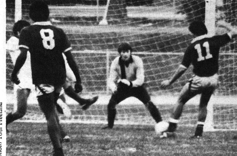
Even from point blank range the Bears couldn't put the ball in the net. They played to a 0-0 draw with Calgary on Friday at Varsity Stadium.