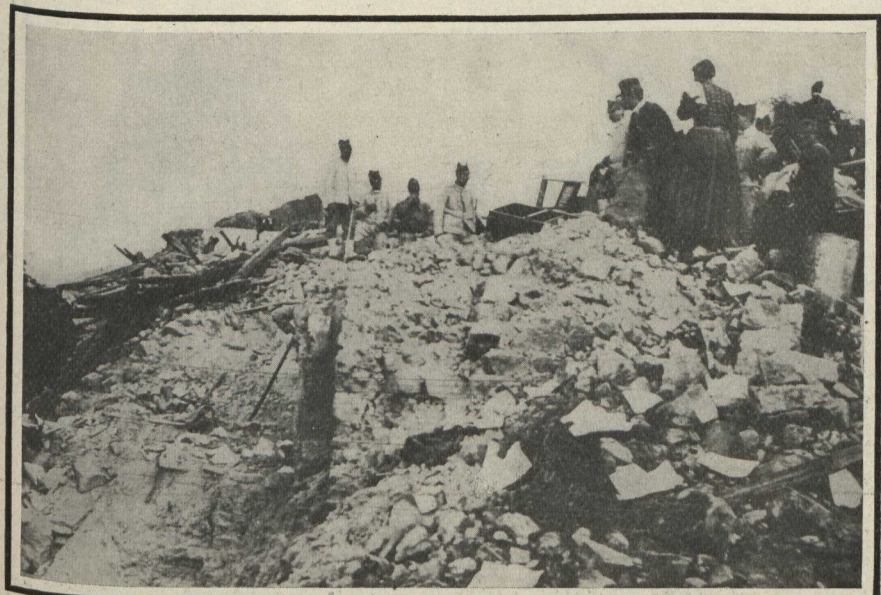
Ruined Houses in Calabria with Soldiers doing salvage work.