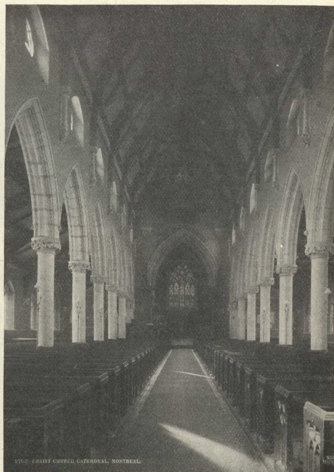
The main aisle of Christ Church Cathedral, Montreal.