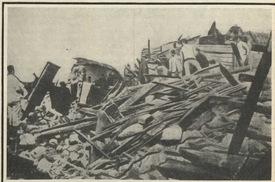
Soldiers searching the Ruins at Palmi in Calabria.