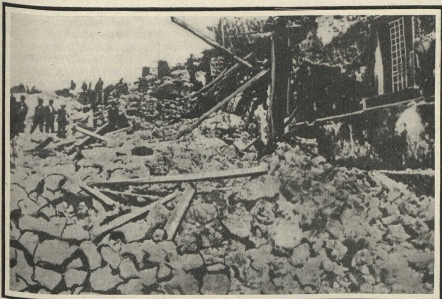
Remains of the Village of Bognaria.