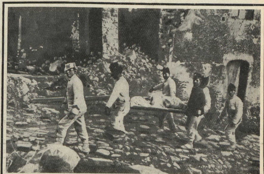
Carrying injured and killed inhabitants away from the wreckage.