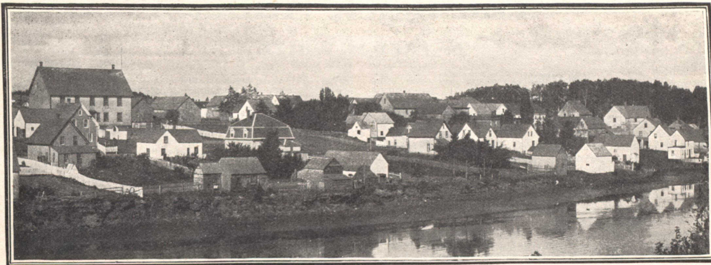
A Typical Prince Edward Village—Montague.