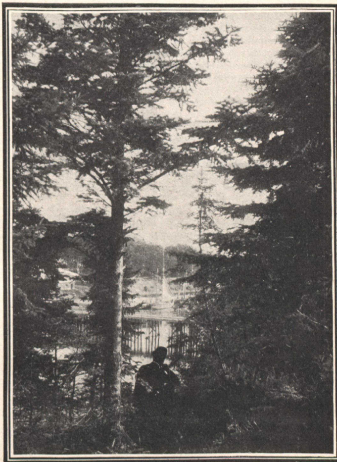
A Shady Nook.