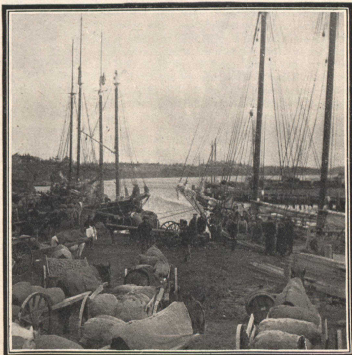
Shipping Vegetables in Coasting Steamers.

SOME SCENES IN PICTURESQUE PRINCE EDWARD ISLAND.