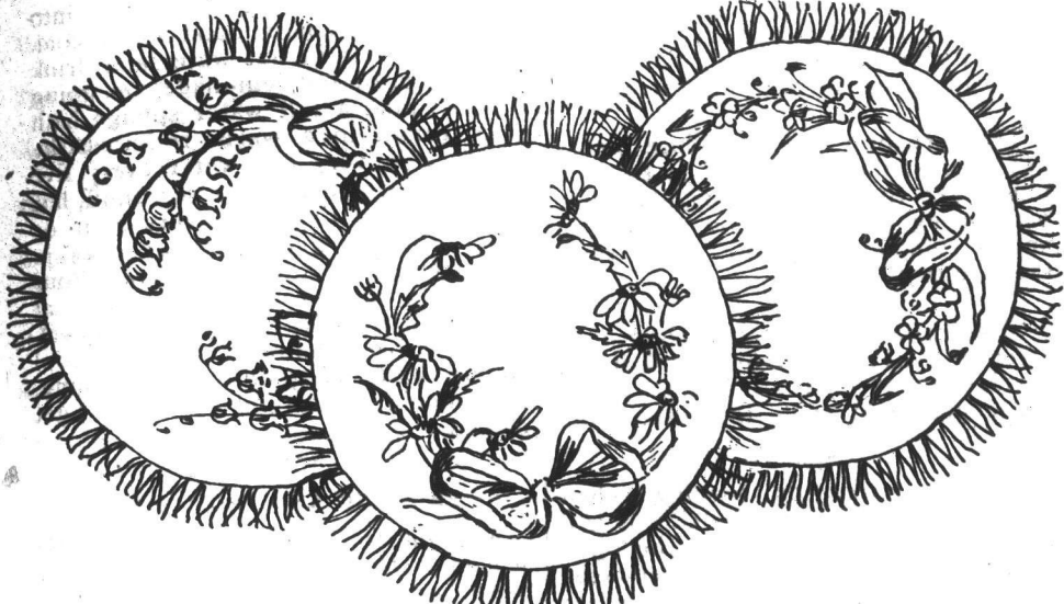
PRETTY FINGER DOILIES

The outer row of roses is made like that in the center, each separately, as far as the 7th row, joining 4th petal to the preceding rose and 5th and 6th petals to 2 loops of the center. Join in this way: Work to center of petal (that is, make 1 double, 1 treble and 5 double trebles) catch in center of corresponding petal of previous rose, and complete the petal;