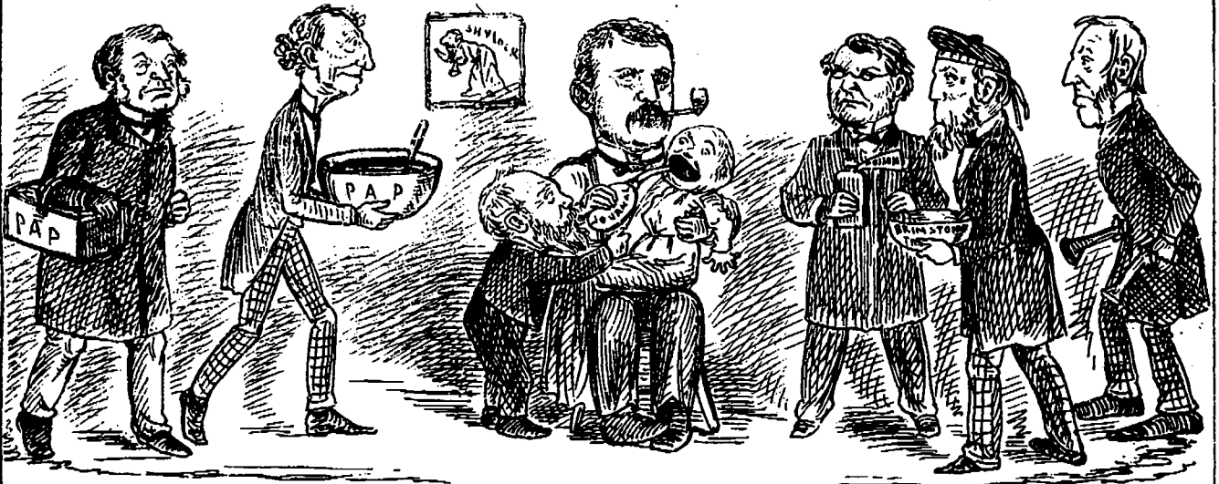
THE RAG BABY GROWS MORE INTERESTING EVERY DAY.

O! had some power the giftie gie us To see ourselves as others see us!