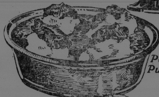
Poor Man's Pudding!