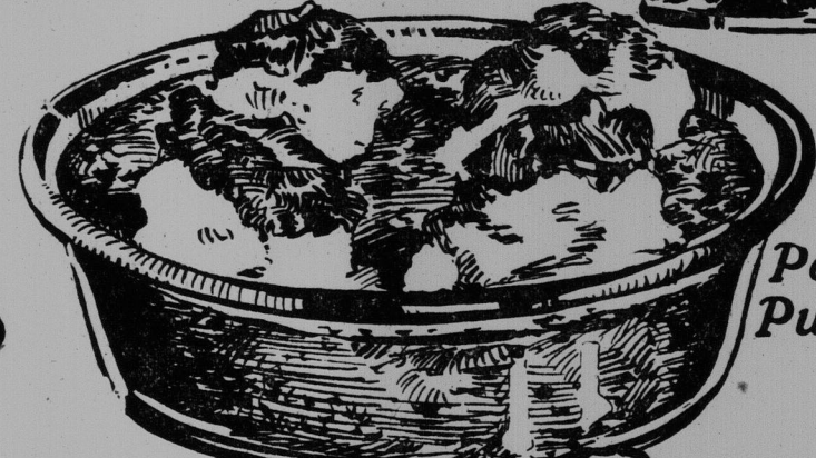
Poor Man's Pudding!

Learn what good things YOU can make with Brown Sugar. Send for useful LANTIC booklet "Grandmother's Recipes." Tells how to use LANTIC Brown for baking, desserts, pickling and candy making, also how to keep it "luscious." Sent for a 2-cent stamp to cover mailing.