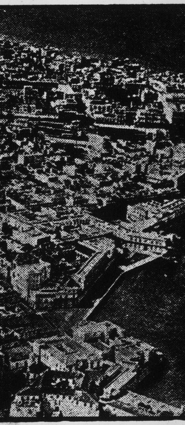
AIRPLANE view of Havana, chief city of Cuba, and one of the gayest cities in the world, which, like Miami in Florida, now bends its energies to repairing damage done by a West Indian hurricane.