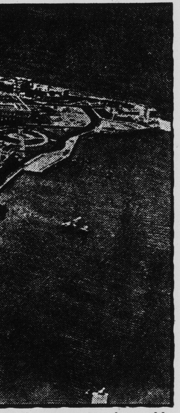
AIRPLANE view of Havana, chief city of Cuba, and one of the gayest cities in the world, which, like Miami in Florida, now bends its energies to repairing damage done by a West Indian hurricane.