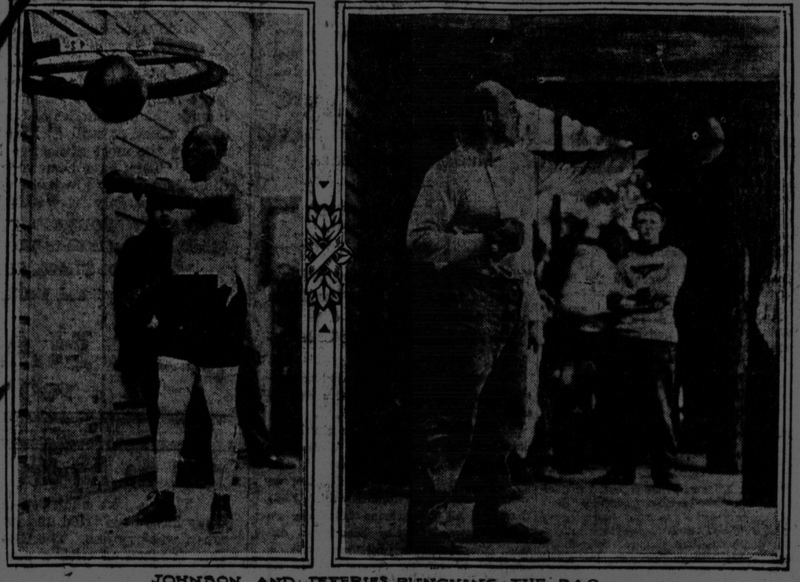
JOHNSON AND JEFFRIES PUNCHING THE BAG

SEND US NAMES AND ADDRESSES And we will furnish your friends, relatives and connections in outside places with Exhibition Literature Including Booklets, Heralds, Transportation Tickets, etc., telling the whole story of the DOMINION EXHIBITION, St. John, N. B., Sept. 5th to 15th