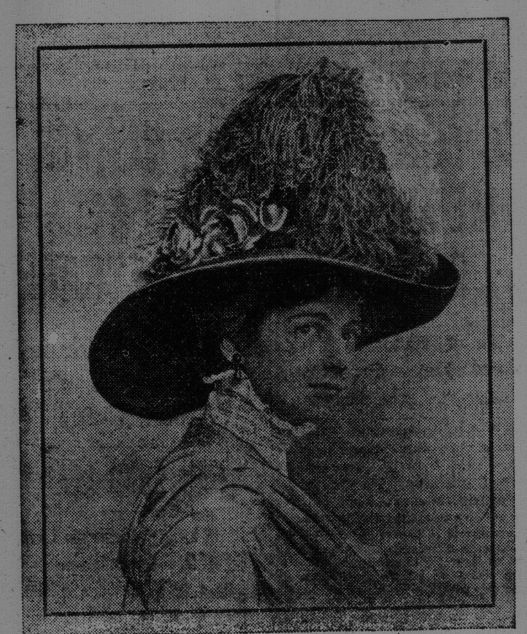
MUSTARD AND GO LD A MILLINER FAD.

The pecular yellowish brown color know as mustard, is extremely fashionable just now. They arem ustard top coats, gowns and hats. This model for earlyl fall is one of the roll brim Cavalier shapes and is covered with moire silk in a dark mustard shade. Two other shades, one quite light, are used in the drooping plumes, and the roses massed at the dowward side of the hat are of