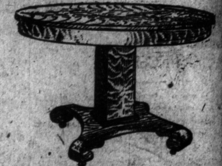
Extension Table, as illustrated, 45-inch solid quarter-cut oak top, heavy square pedestal platform base, colonial feet, 6 ft. when extended. A wonderful special. August Sale price 13.15