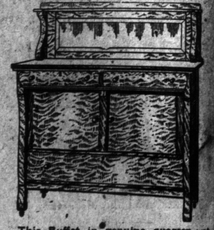
This Buffet in genuine quarter-cut oak, fumed or golden finish, colonial design, 2 top drawers, shaped good cupboard space; long linen drawer; size of case 48 inches; back fitted with large beveled plate mirror. August Sale..... 21.75

Get a Tin of O.M.C. Alumishine O. M. C. Alumishine restores the bright finish to the outside of aluminum ware. It not only cleans, but polishes. See it demonstrated at the Aluminum Counter today, 15c and 35c tins.