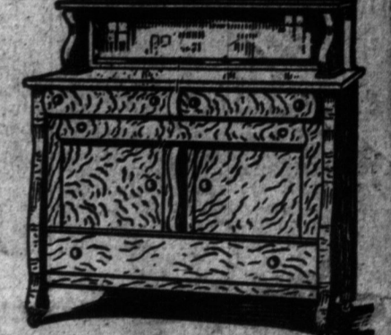
Buffet, colonial design, 52-inch case, plank top, has dolly, cutlery and linen drawer, good cupboard space, pillars and post cross-band veneered, back fitted with large beveled plate mirror. August Sale price..... 29.95