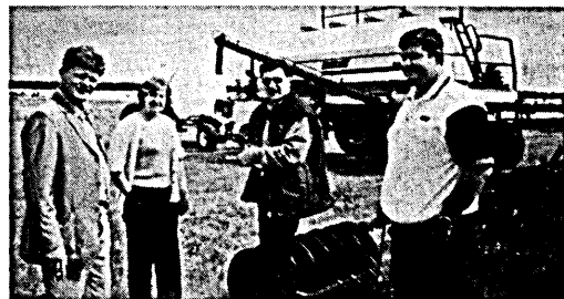
Eastern European Delegation at Western Canada Farm Progress Show.

L ike nourishing food well prepared, it takes planning, skill, communications and knowledge to put on a highly visible result-oriented event such as the annual Western Canada Farm Progress Show (WCFPS) .