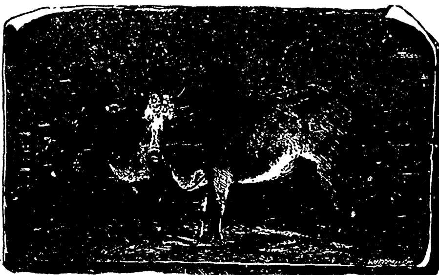
SACRED COW OF THE HINDU.

Let your light so shine before men, that they may see your good works, and glorify your Father which is in heaven. —Matt. 5. 16.