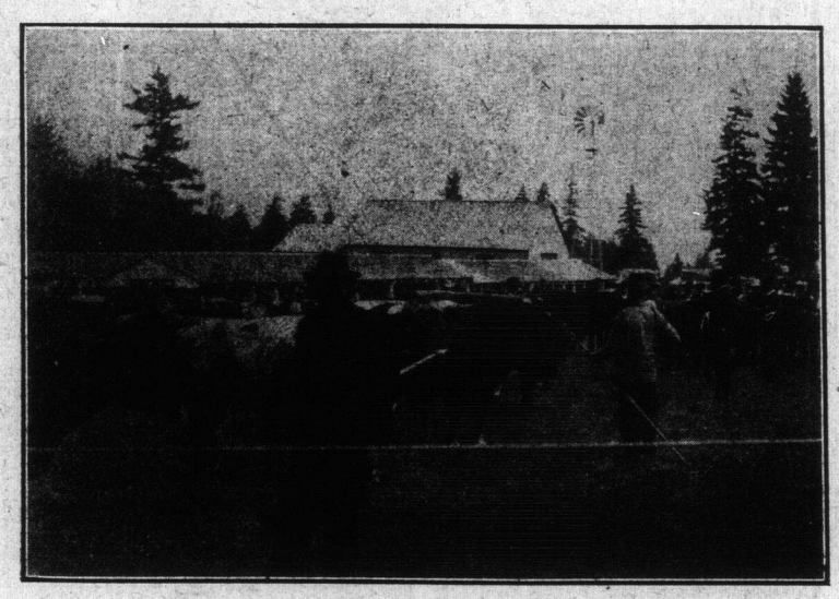
IN THE STOCK RING.