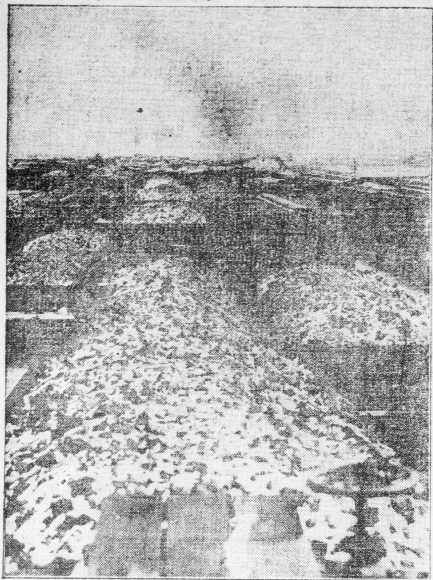
Whole trainloads are waiting removal to the Canadian frontier in the railway yards in Pennsylvania, New York and Ohio.