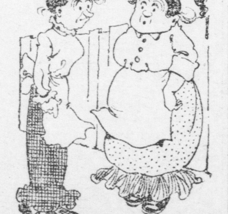
THE DEAR DOCTOR.