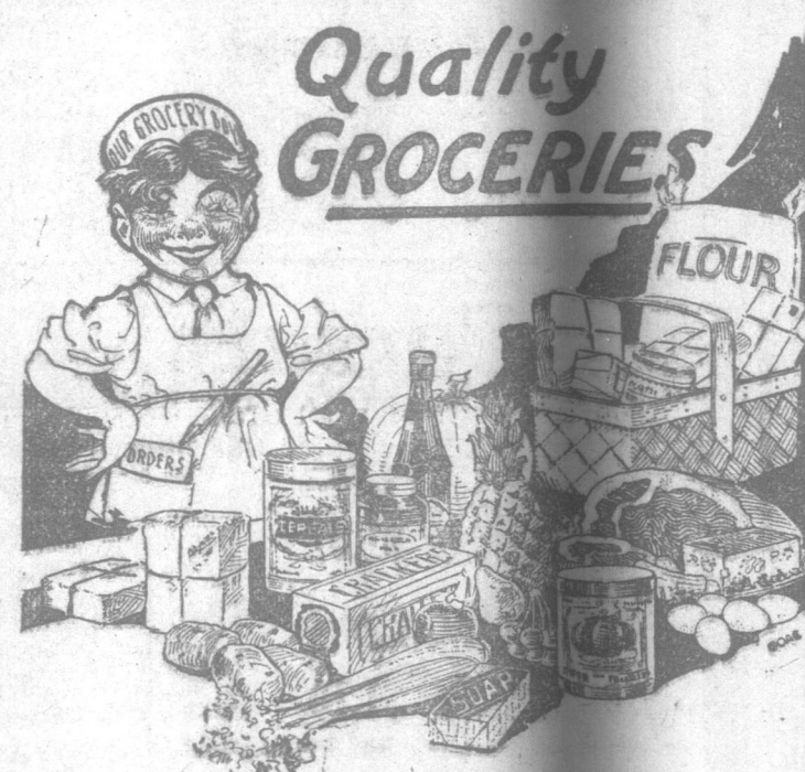
TABLE APPLES GRAPE FRUIT ORANGES LEMONS CRANBERRIES (in Tins): PEACHES APRICOTS PINEAPPLE CHERRIES EGG PLUMS

WESTBURN GOLDEN SYRUP 1's—22c. 2's—40c. IT'S DELICIOUS.