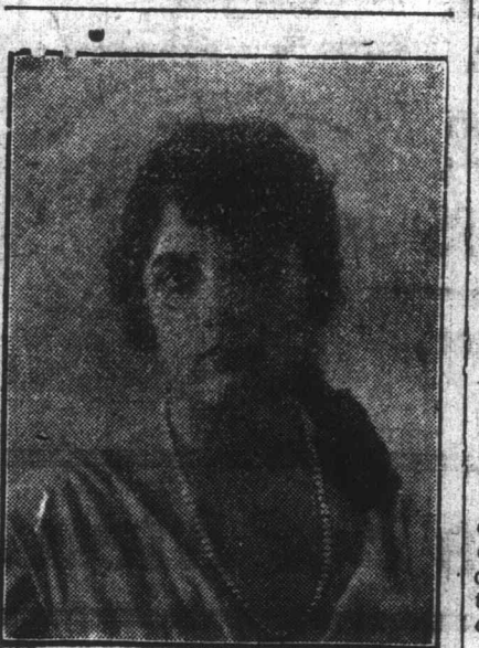
HEDDA NOVA At the Brant Saturday Matinee only