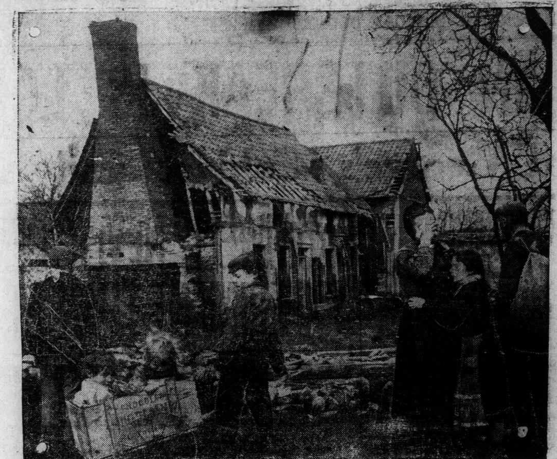
This touching scene, the return of the peasant family to their shell-shattered homestead after the invader has been driven back, is an all too common scene in "la Belle France" these days. The family possessions are easily carried in the sack and basket which the father and sons are carrying, as the enemy's powder and shell have wrought have with the more substantial goods of the household.