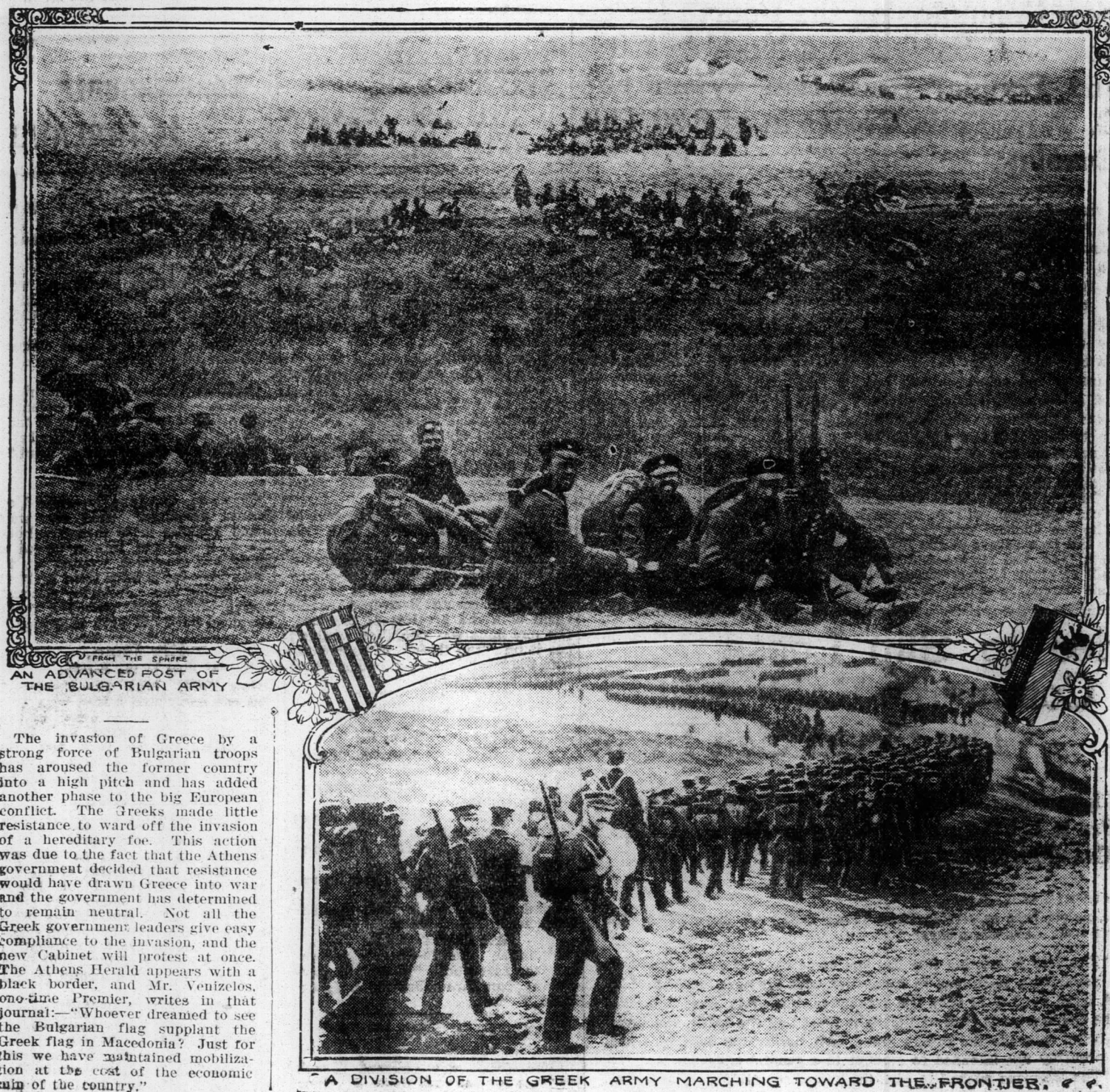
AN ADVANCED POST OF THE BULGARIAN ARMY

The invasion of Greece by a strong force of Bulgarian troops has aroused the former country into a high pitch and has added another phase to the big European conflict. The Greeks made little resistance to ward off the invasion of a hereditary foe. This action was due to the fact that the Athens government decided that resistance would have drawn Greece into war and the government has determined to remain neutral. Not all the Greek government leaders give easy compliance to the invasion, and the new Cabinet will protest at once. The Athens Herald appears with a black border, and Mr. Venizelos, one-time Premier, writes in that journal: "Whoever dreamed to see the Bulgarian flag supplant the Greek flag in Macedonia? Just for this we have sustained mobilization at the cost of the economic aim of the country."